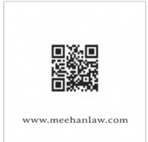
This is some samples of work I did for the law offices of Meehan Meehan & Gavin LLC in Bridgeport, CT. I designed their logo, brochure, business cards and I am currently developing their website.